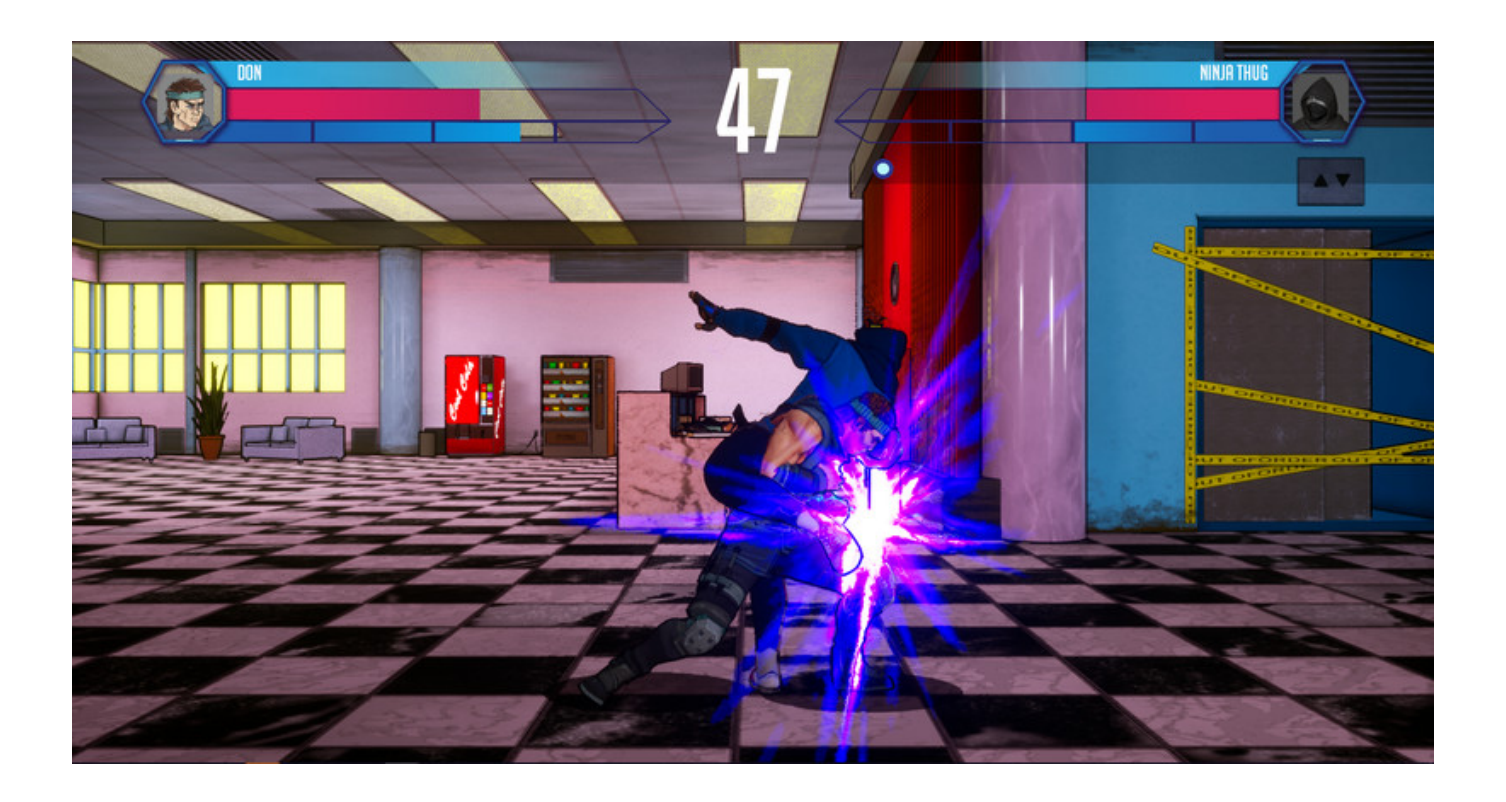
Overclocked: A History Of Violence Download No Virus

Download ->>> <a href="http://bit.ly/2NG5iTl">http://bit.ly/2NG5iTl</a>